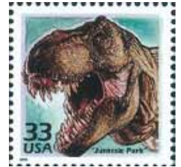
T. rex 2000 (Scott 3191k)