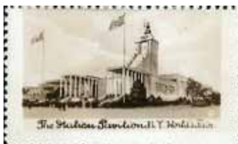
Italian Pavilion, 1939 New York World's Fair Photo Label

A potpourri of material that influenced stamp design and product sales that is often an unrecognized part of our wonderful hobby.