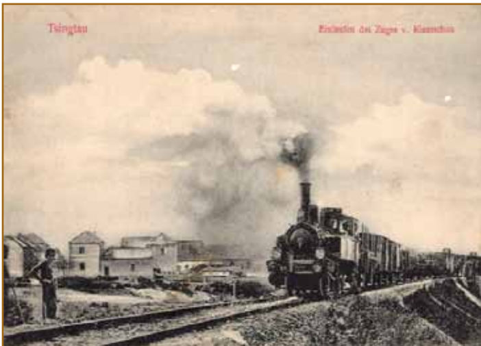
Picture postcard of the Shantung Railway

The postal history of the German Administration of the Shantung Railway, China, (1900–1914), and a discussion of the way the postal history reflected the changing political relationship between China and Germany.