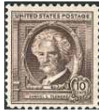
Mark Twain. 1940 (Scott 863)

Mark Twain (1835–1910) is the pen name of Samuel Langhorne Clemens, an American novelist and humorist. He was born in Florida, Missouri, but the family moved to Hannibal, Missouri, on the Mississippi River where he grew up. It was his experiences as a boy in a small town in Missouri that would figure prominently in several of his most famous novels ( The Adventures of Tom Sawyer (1876) and The Adventures of Huckleberry Finn (1884)). But his time as a steamboat pilot, as a reporter on the western frontier and as a traveler abroad would supply the material for many of his other works.