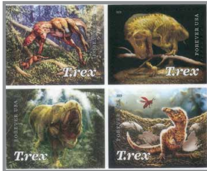
T. Rex 2019