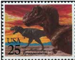
T. rex 1989 (Scott 2422)

T. rex as the dinosaur is named on the stamps is the largest land predator of all time reaching a height of 19 feet, a length of 40 feet and with a huge skull 4 feet in length containing a relatively large brain for a dinosaur. Its jaw contained multiple 6-inch long teeth and had a bite strength of 7,800 pounds, enough to cleave the bones of any prey. The forward looking eyes gave it great depth perception and its ears could pick up low-frequency sounds. It was a member of the Carnosaur order of biped flesh eaters and lived in the Late Cretaceous period (65 to 85 million years ago). T. rex was first described in 1905 and the fossilized remains have only been found in the western North America.