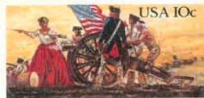
Molly Pitcher, Monmouth, 1778