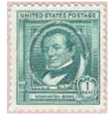
Washington Irving. 1940 (Scott 1859)

Washington Irving (1783–1859) was an essayist, historian and writer of short stories whose travels up the Hudson River as a teenager set the background for his later stories. “The Legend of Sleepy Hollow” appeared along with “Rip Van Winkle” in The Sketch Book of Geoffrey Crayon, Gent (1819–1820), a collection of essays and short stories written by Irving under his pseudonym, Geoffrey Crayon.