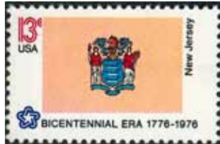
New Jersey State Flag. (Scott 1635)

Besides the United States the cap has been displayed by a number of countries besides France. Although hard to discern, it appears on the state flags of West Virginia, New Jersey and New York and is on the official seal of the United States Senate. [Ref: Linn’s Stamp News 2018; 91(4703):28–37.]