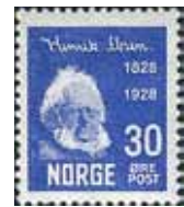
Henrik Ibsen. Norway 1928 (Scott 135)

In 1928 Norway issued a set of four stamps, one of which is shown here to mark the birth centenary of Henrik Ibsen that included Ibsen's signature above his portrait. They are the first stamps showing an autograph. Henrik Ibsen (1828–1906), a Norwegian dramatist and poet, was born in Krisitnia (now Oslo), Norway. His works included Peer Gynt (1867), a drama in verse, and A Doll's house (1879) and Ghosts , dramas in prose on social issues. He is credited with being the first major dramatist to write tragedy about ordinary people in prose and was an important influence on George Bernard Shaw. Later works such as The Master Builder (1892) dealt increasingly with the forces of the unconscious and were admired by Sigmund Freud.