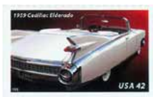
Cadillac Eldorado . 1959 (Scott 4353)