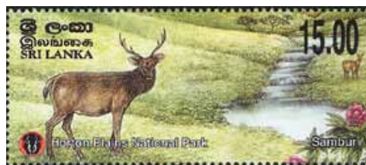
Sambar. (Scott 1759)