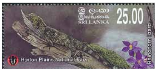
Rhinocorn lizard. (Scott 1760)