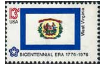
West Virginia State Flag. (Scott 1667)