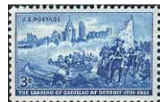
Detroit skyline and 1701 landing of Cadillac. 1951 (Scott 1000) [250th anniversary of the founding of Detroit]

Antoine de la Mothe Cadillac (1658–1730), a French explorer, was born in the French province of Gascony. From 1622 to 1760 the territory now within the borders of Michigan formed a part of New France and the first Europeans to found missions and settlements within those borders were Frenchmen. In 1668 Père Jacques Marquette founded the first permanent settlement within the state and in 1679 René Robert Cavelier sieur de la Salle, built a fort at the mouth of the St. Joseph. On July 24, 1701, Antoine Cadillac searching for a strategic location for a new post to protect and encourage the French fur trade landed near the present site of the Veterans' Memorial building with fifty soldiers, voyageurs and settlers. He constructed a palisaded enclosure and named it Fort Pontchartrain, after his patron, Count Pontchartrain, a minister of Louis XIV. The civilian community within the walls was called Ville d'Étroit ("town of the strait"), which was later anglicized to Detroit. Unfortunately, Cadillac had a number of enemies in Quebec and Paris and Cadillac was removed from Detroit in 1710 and was appointed governor of Louisiana.