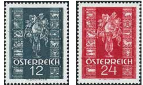
Austria 1937 (Scott 388–389)

In 1937 Austria issued two stamps showing a central rose surrounded by the twelve Signs of the Zodiac. They were issued specifically for use on Christmas Cards. They are also the first stamps to show the Signs of the Zodiac. [Ref: Gibbons Stamp Monthly 2016; 47(7):31–35]