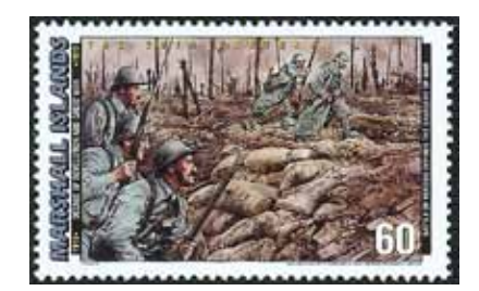
Battle of Verdun, France (1916). Marshall Islands 1997

Distressed by the unfolding events he took a trip across country and on his way to San Francisco from Alaska became ill with what has been described as 'ptomaine poisoning', developed pneumonia and eventually died of an embolism on August 2, 1923. Below are brief descriptions of some of most famous scandals that plagued his administration.