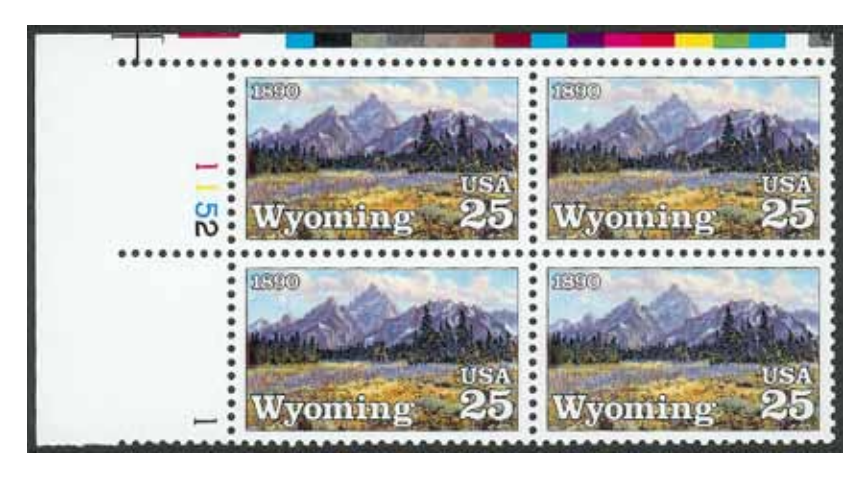
High Mountain Meadows by Conrad Schwiering (1970). Centenary of Wyoming statehood. United States 1990