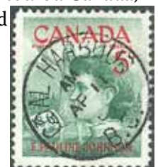
Canada 1961 (Scott 392)

Born to a Mohawk chief and an English mother, she was a very popular poet and performer who toured Canada, England and the United States. She used her poems to celebrate the heritage of her people.