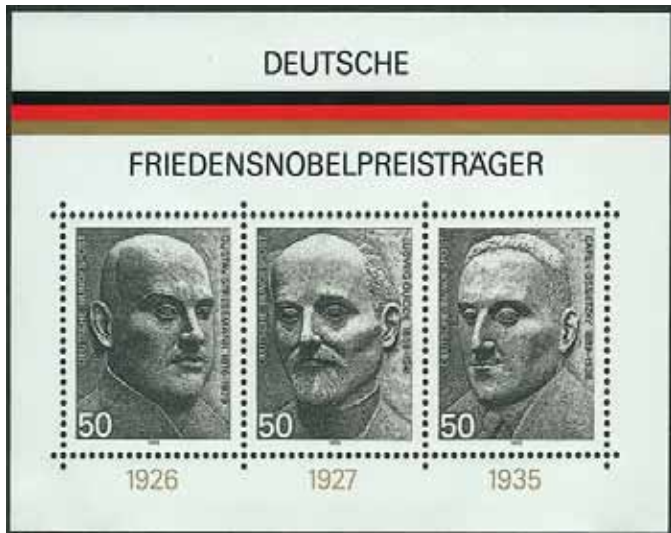
Germany 1975 (Scott 1203)

Gustav Stresemann (1878–1929) shared the 1926 Nobel Peace Prize for his efforts as German Foreign Minister leading to the Locarno Pact in 1925 between France and Germany.