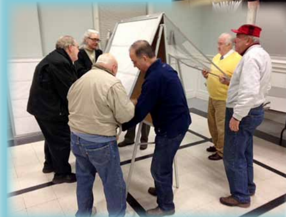
The Westfield Stamp Club frame crew hard at work