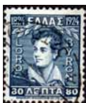
Fig. 2 Lord Byron. Greece 1924 (Scott 316)

So we can now answer the question posed above. This little-known, little-recognized English physician, in his brief exploration of the literary art, created a creature that has become a staple of vampire fiction in books, movies and television.