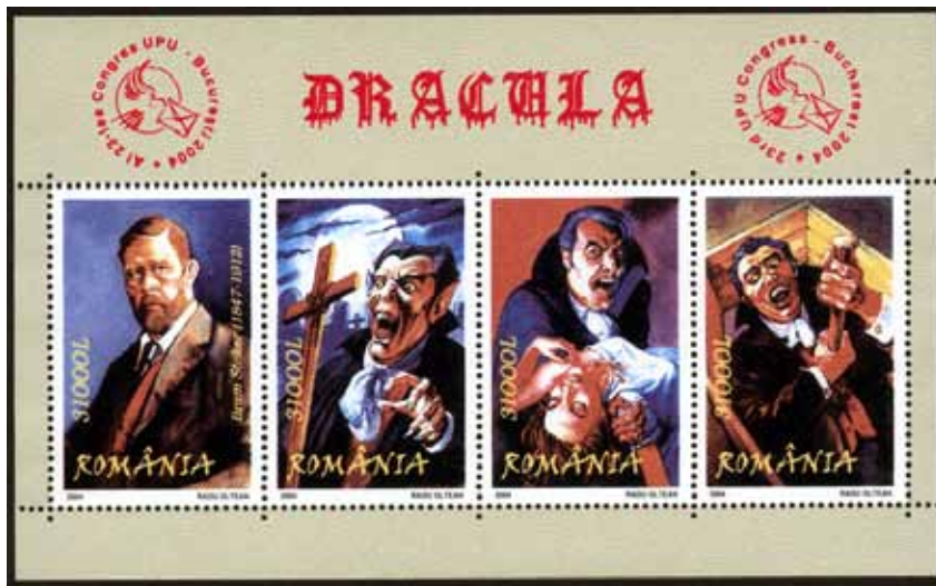
Dracula - a, Bram Stoker, b, Dracula and cross, c, Dracula and woman, d, Dracula in coffin. Romania 2004 (Scott 4638a-d) [ 23 rd UPU Congress, Bucharest]