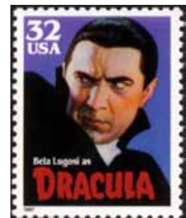
Bela Lugosi as Dracula. United States 1997 (Scott 3169)