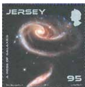
A Rose of Galaxies