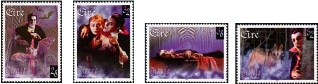
Scenes of Dracula - 28p, being transformed into a bat. 32p, with potential victim, 38p, emerging from coffin, 52p, with wolf. Ireland 1997 (Scott 1086-89)[ Centenary of the publication of Dracula by Bram Stoker]

Unfortunately, I have been unable to find any philatelic commemoration for Polidori, but there have been several issues for Dracula, the creature influenced by Polidori's Lord Ruthven. Bram Stoker, Irish novelist and short story writer was born in Dublin, Ireland in 1847 and died in 1912. His most famous work is Dracula which he wrote in 1897.