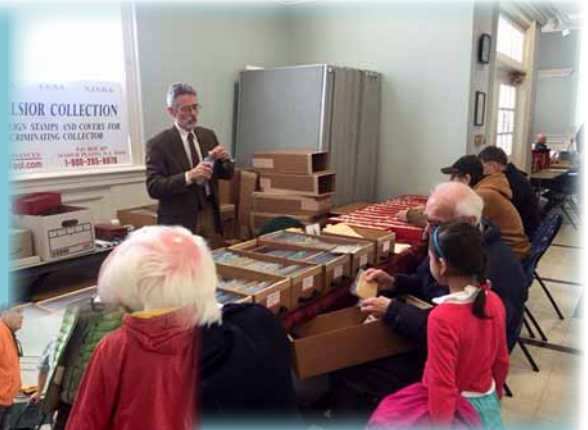
Attendees busy at The Excelsior Collection's table