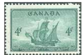
Canada 1949 (Scott 282)

John Cabot (1450–1498) was a Venetian navigator and merchant who, at various times, was in the service of Venice, England and Spain. Settling in Bristol, England in 1484, he began looking for sponsors for a voyage in search of a route to the Orient across the Atlantic Ocean. After receiving permission from Henry VII he sailed westward in Matthew in 1497 and in June reached what is now Newfoundland on the northern coast of North America. He claimed the land for both Venice and England.