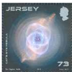
Cat's Eye Nebula