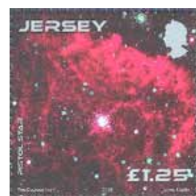
The Pistol Star