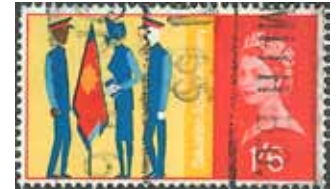
Great Britain 1965 (Scott 425)

casions. The blood shed by Christ is represented by the red on the flag, the star in the center denotes the fire of the Holy Spirit while the blue border stands for purity.