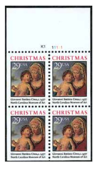
Madonna & Child by Giovanni Battista Cima de Conegliano, 1497. United States 1993 (Scott 2790) [This stamp was also issued in panes of 50, but only the booklet stamp was engraved by Slania.]