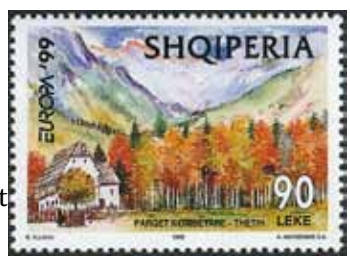
Thethi Park. Albania 1999 (Scott 2591)

Alba, Italy is a commune in Cuneo Province in the Piedmont region of northwest