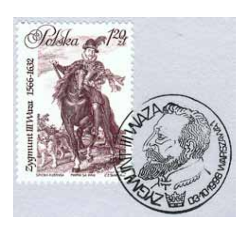
Sigismund III Vasa, King of Poland (1587–1632) and King of Sweden (1592–1599). Sweden 1998 (Scott 2312); Poland 1998 (Scott 3421) [Joint issue]