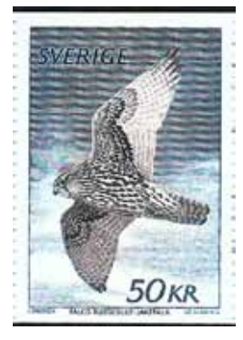
Gyrfalcon. Sweden 1981 (Scott 1351)