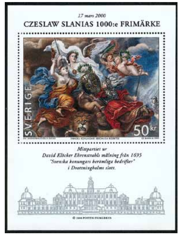
Great Deeds by Swedish Kings. Sweden 2000 (Scott 2374)

After World War II he enrolled in the Academy of Art in Krackow, Poland, where he studied engraving techniques and etching including copper plate engraving. During the 1950s he worked for Poland's Government Printing House and the Polish Post Office where he learned steel engraving. He emigrated to Sweden in 1956 and in April 1960 became an employee of the Swedish Post Office where he re-