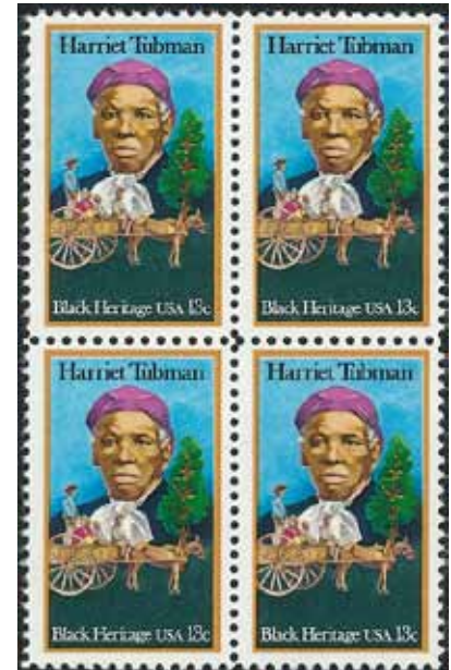
Harriet Tubman and cart carrying slaves. Black Heritage Series 1978

The United States Post Office began the Black Heritage series in 1978 with the stamp shown on the right for Harriet Tubman.