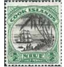
Landing of Capt. Cook. 1932 (53)

1970s and up to 2018 Niue has issued about 1000 stamps in various formats with designs often bearing little or no connection with the island. I would hazard a guess that postally-used, non-philatelic covers would be rather hard to obtain, given the island's small population. Between 1932 and 1950 it used Cook Islands' designs on its stamps but Niue was incorporated in the design. From 1950 onward all stamps just have Niue as the country name.