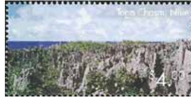
Togo Chasm. 2014