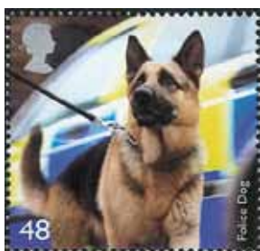
German shepherd 'Max'. [Police dogs are used for guarding, tracking, chasing & arresting.]