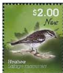
Heahea ( Lalage maculosa )