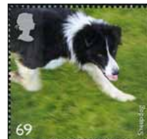
Border collie 'Bob' [Good at herding, chasing, guarding and they can be directed by voice and whistle at long distances.]