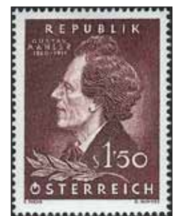
Austria 1960 Birth Centenary