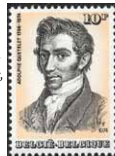
L.A. Quetelet. Belgium 1974

bridge educated and gave his daughters a solid education in the classics and other subjects befitting their status in Victorian England. Although mathematics was not one of those subjects, it was of interest to Florence and she eventually convinced her father, who himself was fond of mathematics, to let her study the subject. Her pursuit of mathematics was influenced by Lambert Adolphe Quetelet (1796–1874), a Belgian statistician and astronomer who applied mathematical methods to vital statistics. Later, in her Notes on Matters Affecting the Health Efficiency and Hospital Administration of the British Army (1858), she would make good use of her mathematical education for she used extensive statistical data to create "polar area diagrams"(1) that gave a graphical face to the mortality figures during the Crimean War. Her diagrams are depicted on the bottom stamp from Portugal. In 1858 she became the first woman member of the Royal Statistical Society in London.