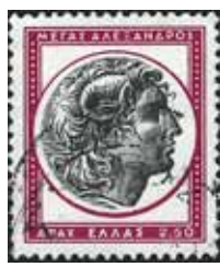
Alexander the Great. Greece 1959