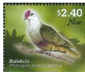
Kulukulu ( Ptilinopus porphyraceus )