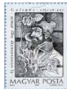
Galen Hungary 1989

But even in that time, there were physicians such as Diagoras of Cyprus (4th–3rd century B.C.), and Erasistratus (304–250 B.C.) from the Greek island of Chios. who condemned the wide use of opium due to its side effects. In fact, Diagoras categorized opium as a lethal substance.