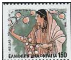
Demeter with poppy capsules. Greece 1986

Opium was used in ancient Egypt as it is mentioned in the Ebers papyrus (ca. 1550 B.C.) where it is attributed to Thoth for use in religious rituals or entertainment by priests, magicians and warriors. Hippocrates (ca. 460–377 B.C.) noted the opium's narcotic effect and other medicinal uses. His works were compiled in the Corpus Hypocraticum and in which opium is mentioned several times suggesting that Hippocrates and his followers used it widely. The use of opium was introduced in India through the conquests of Alexander the Great (356–323 B.C.), King of Macedonia, as he spread the Greek language and culture over much of the known world. His armies traveled as far east as Afghanistan and northern India.