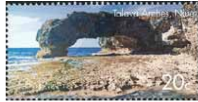
Talava Arches. 2014