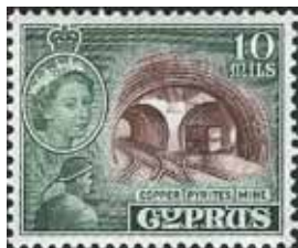
Copper pyrites mine. Cyprus 1955

Since before the Bronze Age (ca. 3500–1500 B.C.), and to this day, Cyprus has been an important source of copper ores in the form of chalcopyrites (copper pyrites), that is composed on one molecule of cuprous (copper) sulfide and a molecule of ferric (iron) sulfide. Chalco comes from the Greek chalkos which means brass and the name was given to the copper pyrites due to the color of the ore, an iridescent, brassy hue. The term pyrites is also applied to other metallic sulfides besides copper.