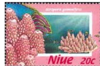
Coral ( Acropora gemmifera ) 1996

The island was formed on a volcano rising from the bed of the ocean and is capped with limestone (carbonates mostly formed by corals) resulting in steep limestone cliffs along the coast with a central plateau that rises to 262 feet above sea level. There are no surface streams on Niue as the rainfall disappears in numerous cracks and seeps in the limestone and over time form arches, chasms or caves. Aquifers that are formed from rainwater that infiltrates the top layer of soil and percolates through the limestone supply the islanders water requirements. Roughly oval in shape it is 11 miles in diameter. The island receives about 80 inches of rainfall a year allowing the growth of a tropical and subtropical broadleaf forest and about 25% of the island still is covered by virgin rainforest that supports abundant birdlife. Arable land presently covers 75% of the island and almost all families grow their own food