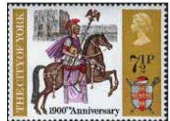
Roman Centurion 1900th Anniv. Founding of York Great Britain 1971

Part horse and part man, Centaurs are the offspring of Centauros, son of Ixion and a king on Thessaly, and the mares on Mount Pelion. When Ixion tried to rape the Goddess Hera, wife of Zeus, she tricked him into having intercourse with a cloud in her image. The cloud gave birth to Centauros, father of the Centaurs.