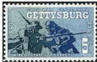
Union & Confederate soldiers at the Battle of Gettysburg in American Civil War. United States 1963

heroin and that this effect was enhanced by intravenous administration. Heroin became a narcotic drug and its abuse began to spread quickly. And while strict regulations on the production and consumption of heroin led to a marked decrease in the 1930s, at the same time there was an increase in the illicit production and trafficking of the drug.