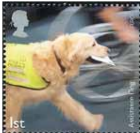
Retriever 'Rowan' [Capable of warning of oncoming seizures, strong sounds and alarms, they have to avoid obstacles, help guide and provide companionship.]