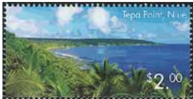
Tepa Point. 2014