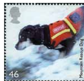
Cross-bred 'Merrick' [Search & Rescue dogs pick up a human scent on wind and air currents that has been effective in locating lost or injured persons.]