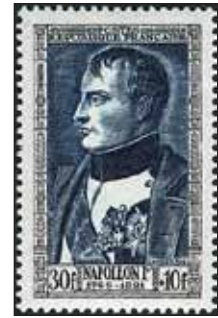
Napoleon I France 1951