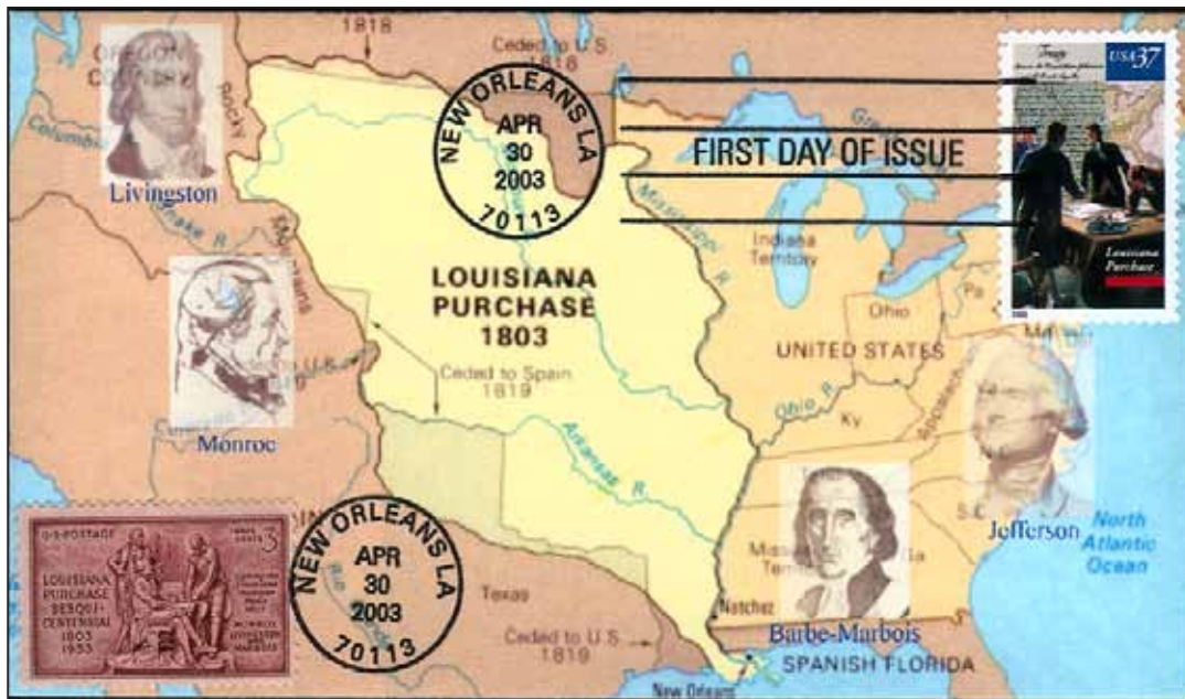
Bicentennial of the Louisiana Purchase. Combo FDC. United States 2003/ Scott 3782 & 1953/ Scott 1020