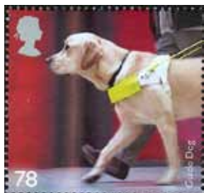
Labrador 'Warwick' [Dogs helping blind people can be traced back to Roman times. The dogs need to be obedient, patient, friendly, intelligent and aware of their surroundings.]