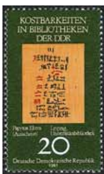
Ebers Papyrus DDR 1981

In the early 19th century British traders were illegally importing opium from India to China. After the practice of smoking opium became popular, the demand for the drug increased dramatically and when edicts making opium illegal were unsuccessful, Emperor Daoguang (Qing Dynasty) banned all trade of opium in 1839, and ordered the seizure of all opium including that held by foreign governments and trading companies. To protect the British merchants and seek compensation for the destroyed opium held by British traders, the British government sent warships in 1840. In this, the First Opium War which lasted until 1842 and the Second Opium War from 1856 to 1860 between the European allies (Britain, France and Russia) and China, China was defeated. The opium trade was legalized, all China was open to British merchants and opium traffickers, additional treaty ports were established and Hong Kong was ceded to Great Britain in perpetuity.