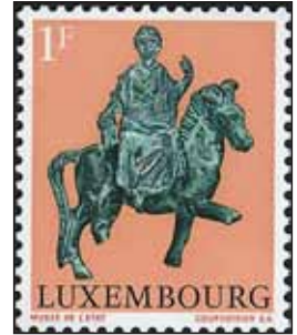
Epona on Horseback Luxembourg 1973

The Celtic goddess of the horse (The Great Mare) was worshipped throughout Gaul and became a Patron of the Roman cavalry units stationed there. Saranyu, the Indian Mare Goddess who may have evolved from Epona, was the Goddess who gave birth to all animals, Mother of all Creatures, Vedic Mare Goddess and Mother of the Centaurs.