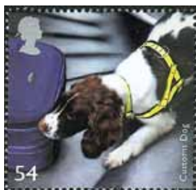
Springer Spaniel 'Max' [It takes about 3 months of intensive training to develop the nose and expertise to uncover anything from drugs and banknotes at airports, in vehicles, etc.]