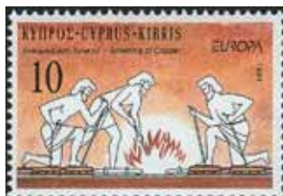
Early smelting of copper. Cyprus 1994