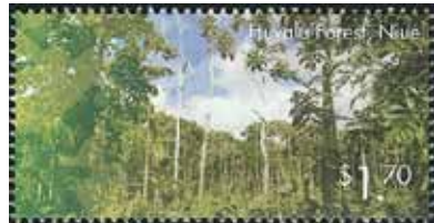
Huvalu Forest. 2014