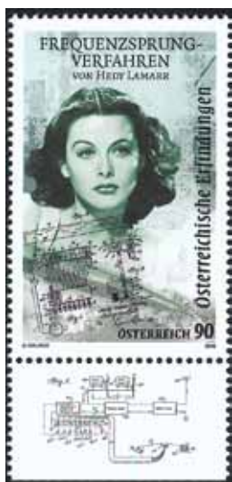
Hedy Lamarr and her invention. Austria 2020

In 1997 Hedy Lamarr was the first woman to receive the Invention Convention's BULBIE Gnass Spirit of Achievement Award, known as the "Oscars of Inventing" and in 2014 Lamarr and Antheil were posthumously inducted into the National Inventors Hall of Fame for their frequency-hopping, spread spectrum technology. Hedy Lamarr died in Florida in 2000 of heart disease at the age of 85 years.