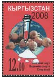
Opium seed capsules and powder & syringe. Kyrgyzstan 2008

In 1874, Charles Romley Wright (1844–1894), an English chemist created heroin, first called dimorphine, but later called heroin, for the German word "heroisch", meaning heroic. In 1898 Bayer synthesized heroin and began commercial production of the drug, marketing it as a nonaddictive substitute for morphine. But it was soon discovered that repeated administration of heroin results in the development of tolerance and the patients soon became heroin-addicts. In the early 20th century morphine addicts "discovered" the euphoria associated with