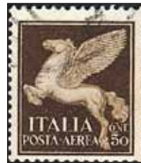
Pegasus Italy 1930

A winged horse, offspring of the god Poseidon and the Gorgon Medusa, that sprang from the blood of Medusa when Perseus cut off her head.