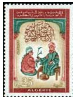
Dioscorides. Algeria 1963

its use can also be found in the De Materia Medica of Dioscorides (A.D. 40–90) and in the works of Galen (ca. A.D. 130–201).