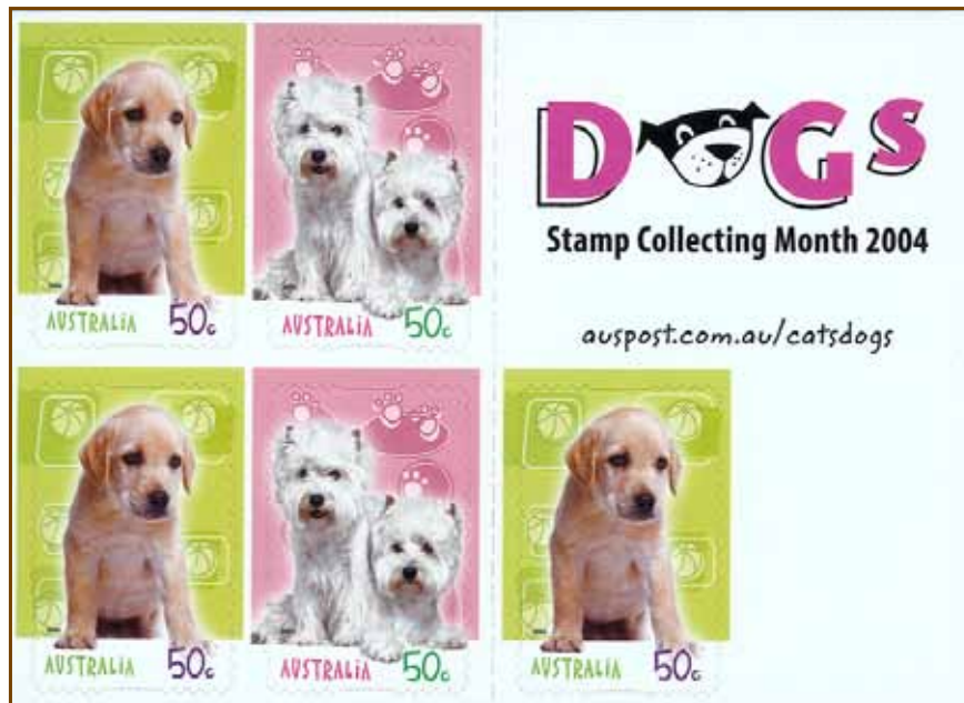
Labrador puppy and West Highland terrier.

[Known since antiquity as a hunting dog of scenthound type.]