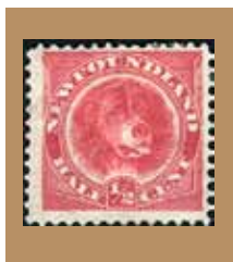
Newfoundland 1887 [1st dog stamp]

Canadian fishermen have used Newfoundland dogs as shipboard working dogs because with their webbed feet they are born swimmers and specialized in water rescues. Their prowess as rescuers is the stuff of legend: "What the St. Bernard is to the Alps, the Newfoundland is to the icy waters of the North Atlantic". Because of their great strength they also earned their keep by hauling fishnets to shore and hauling carts of the day's catch to market. A Newfoundland named Seaman was part of the 1802 Lewis & Clark expedition acting as a hunter and a guard dog and is depicted on a number of Lewis & Clark monuments. Lord Byron erected a monument at Newstead Abbey for his Newfoundland, Boatswain, and another Newfoundland, Brumus, looked after the eleven children of Senator and Mrs. Robert F. Kennedy.