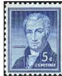
James Monroe (1758–1831) United States 1954