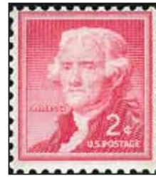
Thomas Jefferson (1743–1826) United States 1954

When the black slaves in Haiti, led by François Dominique Toussaint L'Overture and Jean-Jaques Dessalines, rebelled against the French, Napoleon was forced to send troops to quell the revolt. The prospect of French troops on the island of Hispaniola did not appeal to the Americans and in March 1803 President Jefferson sent James Monroe to France with instructions for him and the American minister in France, Robert R. Livingston (1746–1813), to offer to buy New Orleans from the French. With the war in Haiti going badly and with his plans for a new war with England, Napoleon was receptive to the American overture and offered to sell not only New Orleans but the entire Louisiana territory for $15 million. Jefferson agreed and the United States Senate approved the purchase on October 20, 1803.