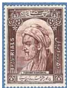
Avicenna Iran 1954

So opium's use as an effective painkiller and to induce anesthesia in surgery was quite common in the ancient world. Besides the medical texts mentioned above,