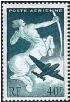
Centaur France 1946