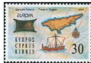
Copper ingot, map and boat signifying the trad- ing in copper by Cyprus. Cyprus 1994