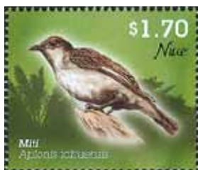
Miti ( Aplonis tabuensis )

for subsistence and sell the surplus either locally or for export. Crops grown for local consumption include the staple food taro, passionfruit, tapioca, yams, bananas, limes, coconuts and vanilla. Major export crops are coconut meat, passionfruit, limes, taro and vanilla and agriculture along with tourism and fishing are the main economies on the island.