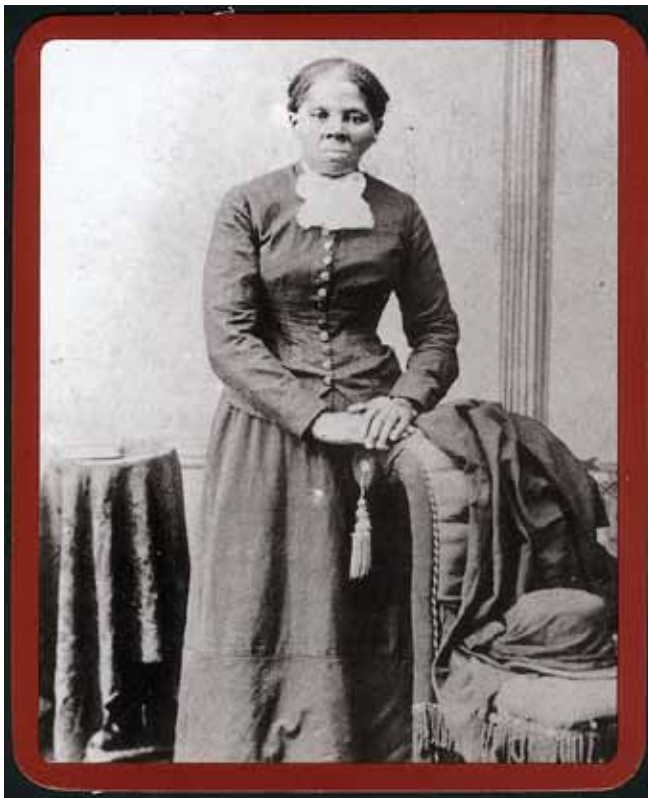
Photograph by H.B. Lindsley. Library of Congress. Published by Pomegranate Publications