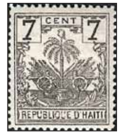
Coat of Arms of Haiti Haiti 1896