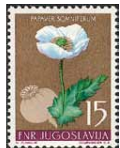
Poppy. ( Papaver somniferum ) Yugoslavia 1957

Opioid: an opiumlike compound that binds to one or more of the three opioid receptors of the body