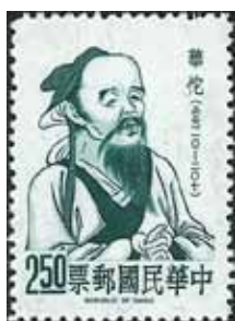
Hua Tao. China 1970

Hua Tao (A.D. 140–208), a Chinese surgeon documents the use of opium in China as an anesthetic during his surgeries. He was the first person to use anesthesia during surgery in China.