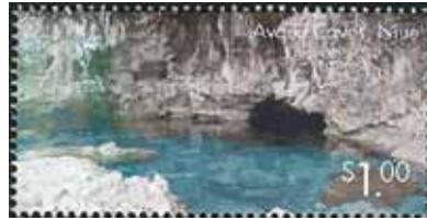
Avaiki Caves. 2014