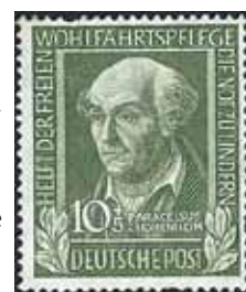
Paracelsus. Germany 1949

In 1527 Paracelsus (1493–1541), a Swiss physician and alchemist created laudanum, an opium-based concoction that has been used in patent medicines for centuries. It is an alcoholic tincture of opium that contains almost all of the opium alkaloids, including morphine and codeine.