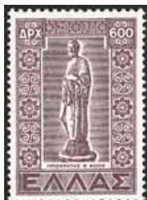
Hippocrates. Greece 1947