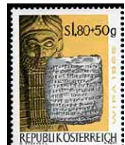
Sumerian cuneiform clay tablet and statue depicting a winged bull with a Human head. Austria 1965

The use of opium was known since the New Stone Age (8,000–3,000 B.C.) and its extraction from the opium poppy can be dated to around 5000 B.C. Poppy cultivation was first documented by the Sumerian civilization in southern Mesopotamia (ca. 3300 B.C.) (1). Its use in Greece dates back to the era of Minoan Crete (ca. 3000 B.C. – 1000 B.C.) where it