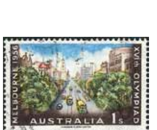
View of Collins Street in Melbourne (Scott 290)