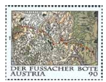
Map of Trans-Alpine route of Fussach Courier Service by Aegidius Tschudi (1505–1572). Austria (Scott 2517)

But letters were also carried and from the end of the 17th century, travelers were allowed to accompany the messengers. It was an arduous journey of 5½ days in good weather, but considerably longer in snow and ice. The messengers traveled across Lake Cosntance and Lake Como, through the Via Mala (an ancient path beside the Hinterrhein River in Switzerland) and other mountain passes and over the Splügen Pass at 6,900 feet in the Lepontine Alps between Switzerland and Italy. [Ref: Gibbons Stamp Monthly 2014; 45(7):103]