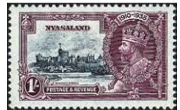
Nyasaland 1935 (Scott 50)