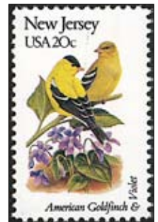
United States 1982 (Scott 1982)

May 10 (Saturday - 1 PM) - "The State Birds and Flowers of the United States" by Frederick C. Skvara. In 1982 the United States Postal Service issued a set of 50 stamps illustrating the state birds and flowers of the United States. This talk will look at how this tradition began and the background and history behind some of the choices.