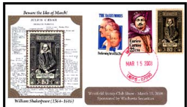
The 2008 Westfield Stamp Club Show Cachet sold out at the show with the last cover sold on eBay after spirited bidding.