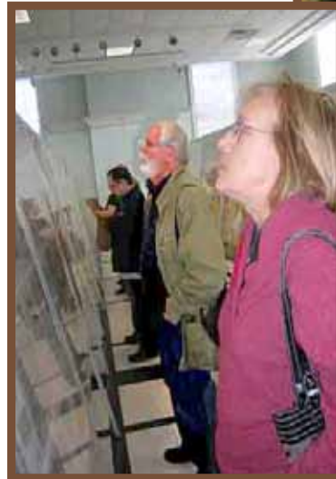
Part of the record crowd at our show viewing the exhibits