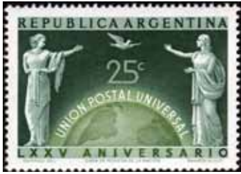
Fig. 1 Argentina 1949 (Scott 586)