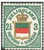
Coat of Arms. Heligoland 1877 (Scott 20) [probable reprint]

Q3. What region in southeastern Albania issued stamps in 1914 under a provisional government before uniting with Greece and then returning to Albania?