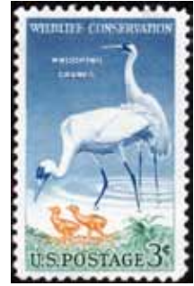
Fig. 4 United States 1957 (Scott 1098)

The “Old Glory” flag stamp issued on July 4, 1957, (Fig. 2) printed in dark blue and deep carmine, was the first United States postage stamp printed on the multicolor intaglio Giori printing press at the Bureau of Engraving and Printing (BEP). The press was purchased from Organisation Giori headquartered in Lausanne, Switzerland, a coordinating group that had been formed in 1952. It was built by Koenig and Bauer, A.G. based in Wurzburg, Germany.