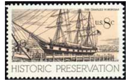
Fig. 2 Whaling ship Charles W. Morgan launched in 1841 from New Bedford, Massachusetts. United States 1971 (Scott 1441)