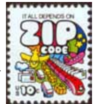
1974 (Scott 1511)

The ZIP program was established in 1963 and was retired twenty-five years later in 1983. His first appearance in the selvage of a United States commemorative stamp was in January 10, 1964, when he appeared on the pane of the 5¢ Sam Houston stamp (Scott 1242). The full story of the Zip Code can be found at the National Postal Museum's web site: www.postalmuseum.si.edu/zip-codecampaign .