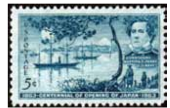
Fig. 4 Centennial of the opening of Japan. Design shows Commodore Matthew C. Perry's ships at night on his first anchorage off Edo Bay in 1853. Mount Fuji is in background. United States 1953 Scott (1021)