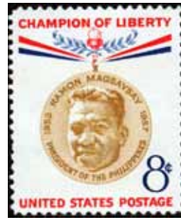
Fig. 3 United States 1957 (Scott 1096)