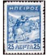
Infantry man with rifle. Epirus 1914 (Scott 8)

Epirus lies on the Balkan Peninsula across the northwestern frontier of modern Greece and the southeastern frontier of Albania. Between 1912 and 1914 the region was occupied by the Greek Army, but in 1914 the local population established the Autonomous Republic of Northern Epirus and issued its own stamps. Greece reoccupied the country in October 1914 and it became a department of Greece using overprinted Greek stamps. In 1916 Greece withdrew and the northern area was formally ceded to Albania.