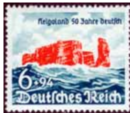
Heligoland. Germany 1940 (Scott B176)

Helgoland is a tiny island in the North Sea in the waters known as the German Bight only 28 miles off the coast of Germany. With the 1814 Treaty of Kiel that ended hostilities between Denmark and Sweden, Helgoland was formally ceded to Great Britain. In 1890 it was absorbed into the German Empire and is now called Heligoland, part of Schleswig-Holstein in the Federal Republic of Germany. Prior to World War I Germany fortified the island with large guns and established a naval base. Some of the fortifications were destroyed following Germany's defeat in the war, but as World War II approached, the Nazis began construction of a new submarine base. Allied bombardments during World War II were intense and by 1945 the island was left uninhabitable and under British control. In 1952 the island was returned to Germany and the inhabitants, who had been removed from the island previously, returned and resumed farming and fishing. Stamps were issued between 1867 and 1888, but were reprinted between 1875 and 1895.