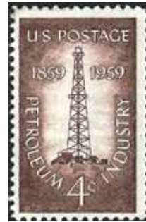
Fig. 1 Centenary of completion of oil well in Titusville, Pennsylvania. United States 1959 (Scott 1134)

Besides the question of opening trade with Japan, we faced the necessity of protecting American whalers. President Fillmore (1800–1874) (Fig. 3) took action and sent Commodore Perry to Japan with a letter dated November 13, 1852, and addressed to the Emperor of Japan. The letter asked that Japan open its lands to trade and to treat with kindness any American sailors that it came in contact with. On July 8, 1853, Commodore Perry arrived in Edo Bay 2 , delivering President Fillmore's letter and one from himself as well (Fig. 4). After staying less than ten days he sailed to the China coast on July 17 after giving full warnings to the Emperor that he would return later with a larger fleet to discuss the Japanese decision. Perry returned in February 1854 with a state of the art flotilla putting serious pressure on Japan for formal articles of convention between the United States and Japan ensuring the protection of American sailors and opening trade with the United States. The Tokugawa shogunate 3 agreed to all American demands and signed the Treaty of Kanagawa with Commodore Perry on March 31, 1854.