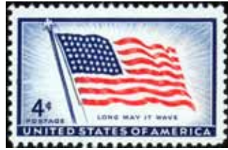
Fig. 2 United States 1957 (Scott 1094)