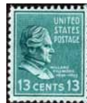
Fig. 3 Millard Fillmore (13 th President, 1850–53). United States 1938 (Scott 818)