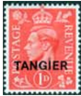
British Offices Abroad - Morocco 1937 (Scott 516)

The port of Tangier in northern Morocco lies on the Strait of Gibraltar and was part of the French Protectorate of French Morocco from 1912 to 1956. Since its beginning as a Phoenician trading post in the fifteenth century B.C., Tangier has had a varied history including its status, with the surrounding suburbs, as an international zone from 1923 to 1956. With the recognition of Morocco's independence in 1956, the international administration (France, Great Britain and Spain) transferred control of Tangier to Morocco. Stamps of France, Great Britain and Spain were overprinted with "Tangier" for use in the zone.