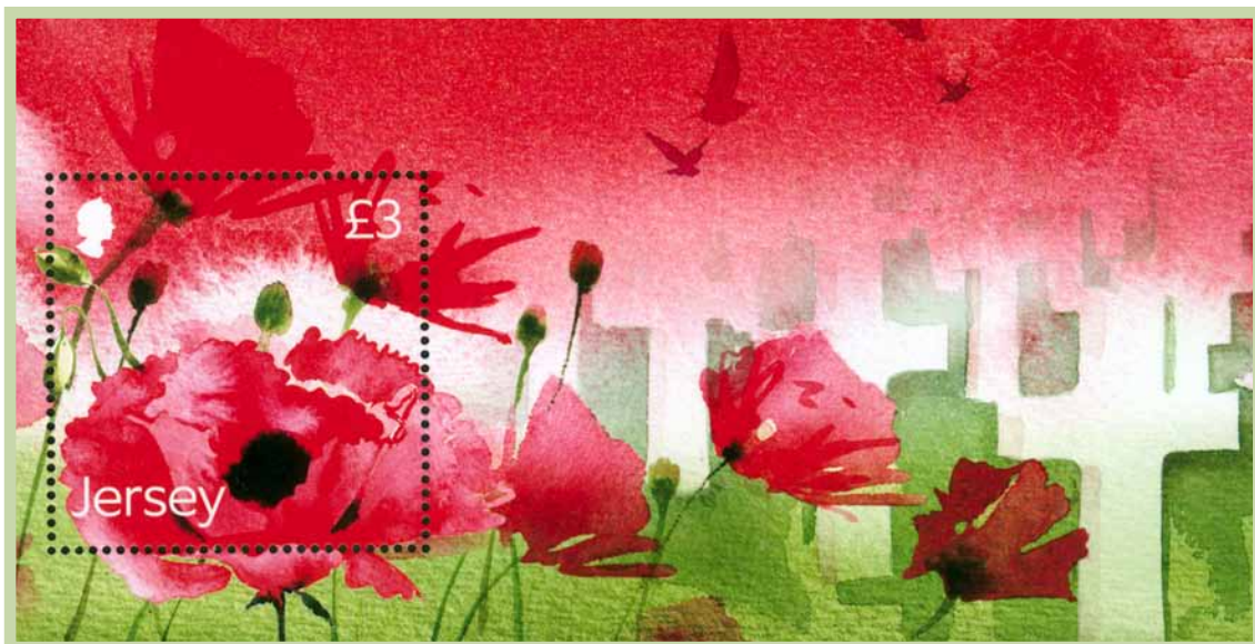
Poppies in Flanders Fields – World War I Centennial. Jersey 2014

A number of countries have started to issue stamps for the centennial of this bloody war and several are illustrating their issues with poppies as Jersey has done with the souvenir sheet seen below.