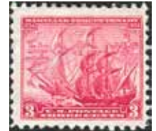
The Ark and the Dove. Maryland Tercentenary Issue. 1934 (Scott 736)

On November 22, 1633 the Ark , a merchant vessel and the Dove , a pinnace, left Cowes, on the north shore of the Isle of Wight, travelled down the west coast of Africa, crossed the Atlantic Ocean to the West Indies and then sailed north to the Chesapeake Bay. On board were Leonard Calvert, governor and George Calvert, as deputy, both being brothers of Cecil Calvert, Second Lord Baltimore. On March 3, 1634 they entered Chesapeake Bay and on March 25 they landed on what is now known as Blackstone Island.