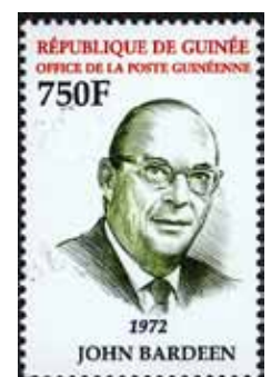
John Bardeen. Republic of Guinea 2002 (Scott 2131d)