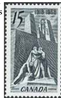
Canada 1968 (Scott 486)