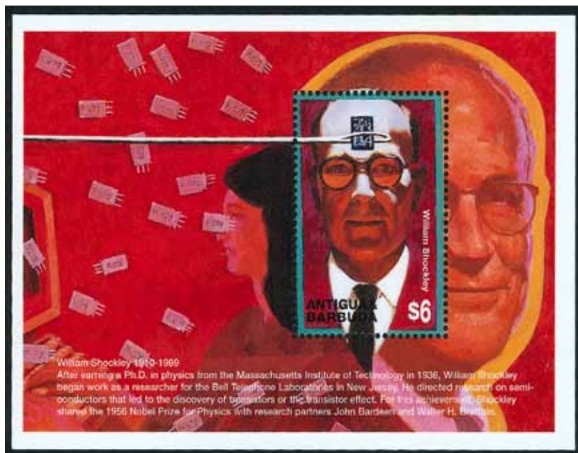
William Shockley, with transistors in the background. Antigua & Barbuda 1998 (Scott 2131d)