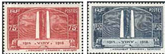
France 1936 (Scott 311-312)

Ans. Canadian soldiers who died in France during World War I