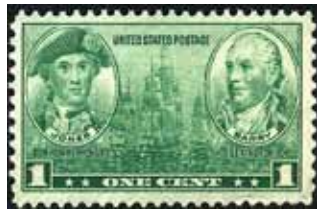
John Paul Jones and Bonhomme Richard (left) and John Barry and Lexington (right). 1936 Commission. Throughout the Revolutionary War

John Barry (1745-1803), captain of Lexington , a 14-gun brigantine, captured Edward , an eight-gun tender of the British Royal Navy. It represented the first armed British ship taken under the authority of the Continental Marine Commission. Throughout the Revolutionary War and afterward Barry was involved in a number of naval battles. He was instrumental in the establishment of a separate Department of the Navy and is considered the father of our navy.