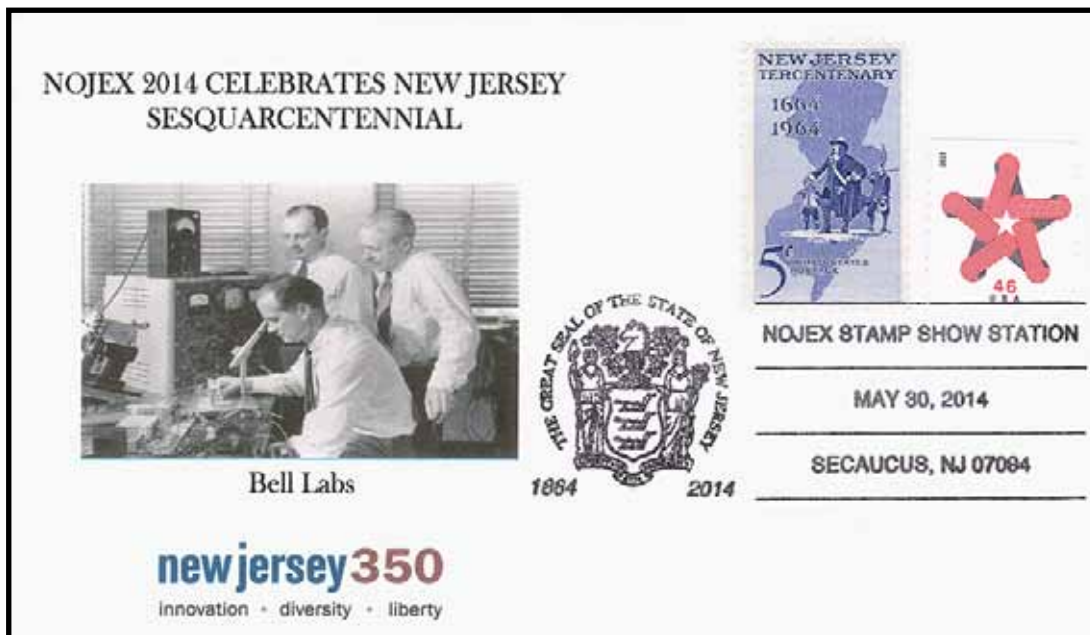
1948 photograph showing William Shockley (seated), John Bardeen (standing on left) and Walter Brattain (standing on right)

The three men looked familiar to me and I was fairly certain that they were the three researchers who won the 1956 Nobel Prize in Physics “for their researches on semiconductors and their discovery of the transistor effect”. They all worked at Bell Labs and their development of the transistor led to the computer age. William Bradford Shockley (1910–1989) received his doctorate in physics from the Massachusetts Institute of Technology, Walter Houser Brattain (1902–1987), who was born in China, was educated at Whitman College and the universities of Oregon and Minnesota and John Bardeen (1908–1991) who received a doctorate in mathematics and physics from Princeton University.