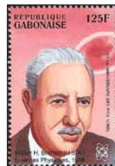
Walter Brattain. Gabon 1995 (Scott 803a)