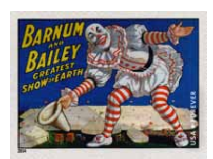
Clown stamp from the Vintage Circus Poster pane of sixteen. (Scott 4898) issued May 5, 2014