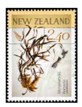
Marginariella boryana.