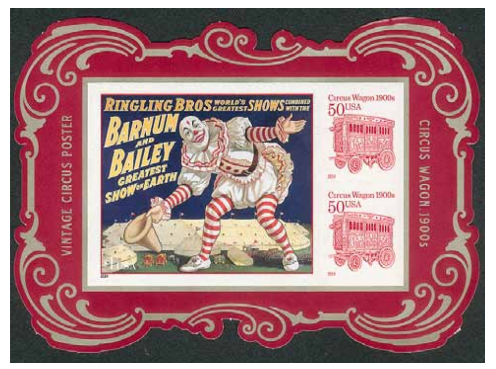
$2 Circus souvenir sheet included in the 2014 Stamp Yearbook with die cuts around the individual stamps.

The souvenir sheet with die cuts around the individual stamps is included with the stamps in the 2014 Stamp Year-book that sells for $64.95 and that is the only way the mint souvenir sheet is being made available. A press sheet was also available, but I think I read that it is now sold out. The individual stamps in the press sheet do not have die cuts, but the edges of the sheet itself will have die cuts.