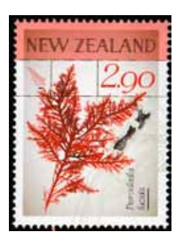
Pterocladia lucida. (Scott 2505)

The islands of New Zealand lie between the Tasman Sea to the west and the Pacific Ocean to the east and over 900 species of seaweeds have been recognized around their coasts. Seaweeds are photosynthetic marine macroalgae and come in three major groups - green, brown and red algae. In marine ecosystems they are vital to food chains, provide shelter and create habitats for invertebrates and vertebrates. They can be found in shallow intertidal areas as well as in deeper waters along as there is sufficient sunlight to support their growth. Using the energy of sunlight they make organic molecules that then become key elements in ma-