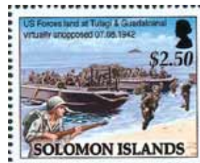
Solomon Islands 2005 (Scott 999d)