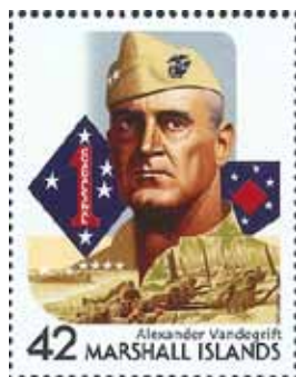
General Alexander Vandegrift. Marshall Islands 2008 (Scott 910h)

the two small neighboring islets, Gavutu and Tanambogo. The force consisted of the amphibious-trained 1st Marine Division commanded by Major-General Alexander A. Vandegrift, and included the 7th Marine Regiment and battalions of the 2nd Marine Regiment. The force landed on August 7 and encountered heavy resistance on Tulagi and the islets. On Guadalcanal they landed on 'Red Beach', on the north coast of the island, where they experienced minimal resistance as the Japanese that were there were mainly laborers. Four Allied heavy cruisers were sunk during the landings – three American ships ( Quincy , Astoria and Vincennes ) and one Australian ( Canberra ).