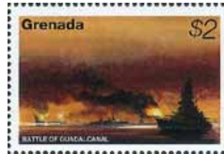
Grenada 1995 (Scott 423Af)