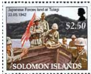
Japanese forces land on Tulagi, May 3, 1942. Solomon Islands 2005 (Scott 999a).

By August 9, Tulagi and the islets, as well as the airstrip on Guadalcanal were in the control of the Allies. By August 18 the airfield that the Japanese had started was completed by the marines and ready for use. It was named Hendersen Field after a marine pilot killed in the Battle of Midway that occurred between June 4-7. Between August and December 1942, Allied air power, mainly based on Henderson Airfield, were referred to as the 'Cactus Air Force.' 'Cactus' was the code name the Allies used for Guadalcanal.