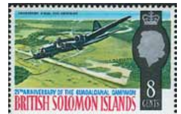
Solomon Islands 1967 (Scott 174)