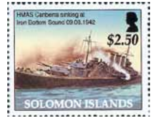
HMAS Canberra sinks in Iron Bound Sound off Guadalcanal. Solomon Islands 2005 (Scott 999e)