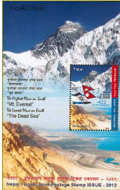
Nepal 2012 (Scott 875)