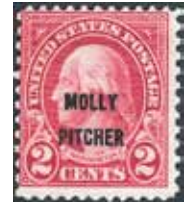
1928 (Scott 646)

On October 20, 1928, the United States Post Office Department issued the 1926 two-cent George Washington regular issue stamp (Scott 634) overprinted “Molly Pitcher” (the stamp was not listed in the Scott Catalogue of United States Stamps & Covers until 1998). The stamp was issued for the 150th anniversary of the Battle of Monmouth that took place on June 28, 1778, in Monmouth County, New Jersey and was one of the largest battles of the American Revolution. British troops under the command of Sir Henry Clinton and loyalists were moving from Philadelphia to New York City when they were interrupted by the Continental Army led by General George Washington and General Anthony Wayne at the Monmouth Courthouse. The bulk of the battle was fought around the bridge over the Spotswood Middle Brook. Eventually, the Continental Army forced the British to retreat.