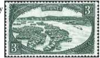
Dwellings in Kampong Ayer. Brunei 1947

Brunei is an independent sultanate in the northeast part of the island of Bornea in the Malay Archipelago. Development of the current capital, Bandar Seri Begawan, began in 1906 on land on the west bank of the Brunei River. But for hundreds of years the capital was Kampong Ayer (Water Village or Brunei Town), a village almost entirely built on stilts over saltwater in Brunei Bay and was dubbed the "Venice of the Orient". Kampong Ayer is now part of Bandar Seri Begawan which is mostly built on land.