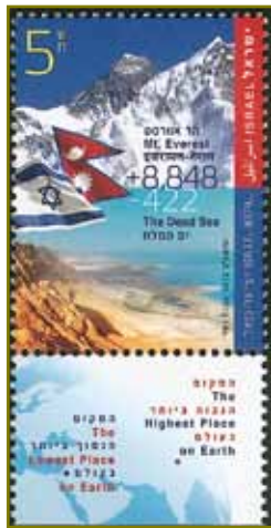
Israel 2012 (Scott 1944)