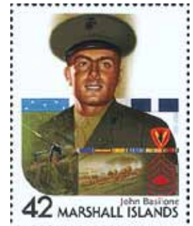
Sgt. John Basilone. Marshall Islands 2008 (Scott 910g)