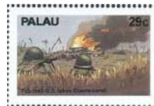
U.S. forces take control of Guadalcanal, February, 1943. Palau 1993 (Scott 316a)