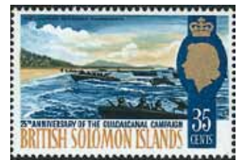
Solomon Islands 1967 (Scott 175)