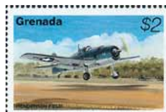
Grenada. 1995 (Scott 2423Ag)