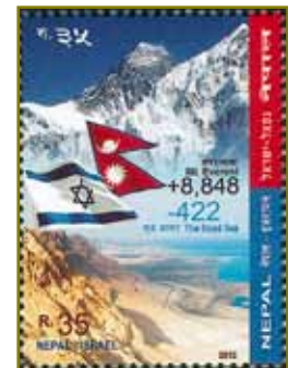
Nepal 2012 (Scott 874)