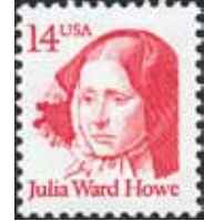
1987 (Scott 2176)

Her husband was an official of the Sanitary Commission and on one of his supervising trips to review the Union troops in Virginia, Julia was invited to go along. When they heard that Confederate forces were moving toward them, they returned to Washington and Julia, who was trained as an opera singer led the party she was with in singing “John Brown’s Body”, a hymn written for camp meetings by William Steffe, a South Carolina-born Philadelphia bookkeeper. Julia composed a patriotic poem for that song at the Willard Hotel in Washington on November 20, 1861. It was first published in the Atlantic Monthly in February 1862.