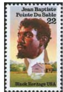
1987 (Scott 2249)