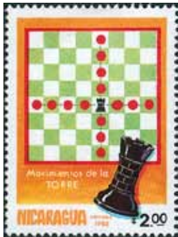
Chess Moves: Castle. Nicaragua 1983 (Scott 1279)