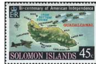
Solomon Islands 1976 (Scott 336)