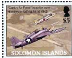
'Cactus Air Force' from Henderson Airfield over Guadalcanal. Solomon Islands 2005 (Scott 999f)

Patch's mission to drive the Japanese off Guadalcanal was aided by the decision of the Japanese in Rabaul in mid-December to abandon any further attempts to retake Guadalcanal. Japanese destroyers on February 7-8, 1943, evacuated 13,000 troops from Guadalcanal and by February 9 the battle for Guadalcanal was over. The losses in the Guadalcanal campaign amounted to 24,000 Japanese lives and 1,600 American lives.