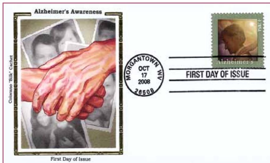
Alzheimer's Disease Awareness. U.S. 2008 (Scott 4358) [First Day Cover with Colorano "Silk" cachet.]