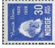
Henrik Ibsen. Norway 1928 (Scott 135)

An autograph of St. Francis Xavier appears as the central motif in a 1931 Portuguese India stamp (Scott 415) of a set of six issued for the Exposition of St. Francis Xavier at Goa in December 1931. [Ref: Gibbons Stamp Monthly 2003; 33 (12): 76–78.]