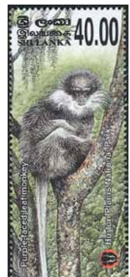
Purple-faced leaf monkey. (Scott 1761)