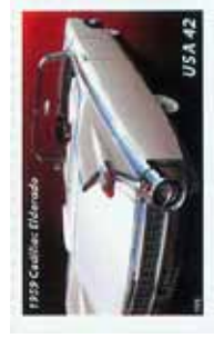
Cadillac Eldorado . 1959 (Scott 4353)

patron, Count Pontchartrain, a minister of Louis XIV. The civilian community within the walls was called Ville d'Étroit ("town of the strait"), which was later anglicized to Detroit. Unfortunately, Cadillac had a number of enemies in Quebec and Paris and Cadillac was removed from Detroit in 1710 and was appointed governor of Louisiana.