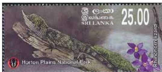
Rhinocorn lizard. (Scott 1760)