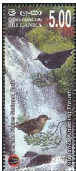
Sri Lanka Whistling thrush. (Scott 1758)

Sri Lanka is an independent island state in the Indian Ocean south of India with several official names – Sri Lanka Prajatantrika Samajavadi Janarajaya (Sinhala); Ilanga Jananayaka Socialisa Kudiarasu (Tamil) (Democratic Socialist Republic of Sri Lanka). The two main ethnic groups are Sinhalese (75%) and Tamil (11%) and the two official languages are Sinhalese and Tamil. The name of the country is printed in three languages on their stamps. In the 2010 stamps shown here for the Horton Plains National Park, Ceylon is printed in Sinhalese at the top, Tamil in the center and English on the bottom.