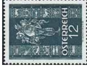
Austria 1937 (Scott 388–389)

In 1937 Austria issued two stamps showing a central rose surrounded by the twelve Signs of the Zodiac. They were issued specifically for use on Christmas Cards. They are also the first stamps to show the Signs of the Zodiac. [Ref: Gibbons Stamp Monthly 2016; 47(7):31–35]