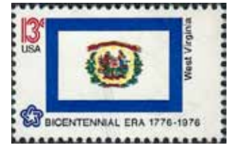
West Virginia State Flag. (Scott 1667)