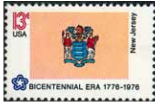
New Jersey State Flag. (Scott 1635)

Besides the United States the cap has been displayed by a number of countries besides France. Although hard to discern, it appears on the state flags of West Virginia, New Jersey and New York and is on the official seal of the United States Senate. [Ref: Linn’s Stamp News 2018; 91(4703):28–37.]