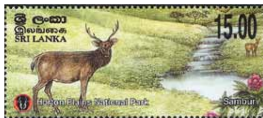
Sambar.