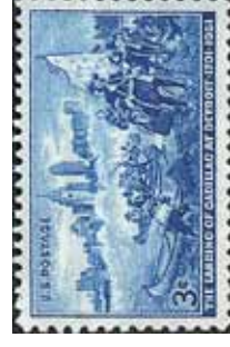
Detroit skyline and 1701 landing of Cadillac. 1951 (Scott 1000) [250th anniversary of the founding of Detroit]