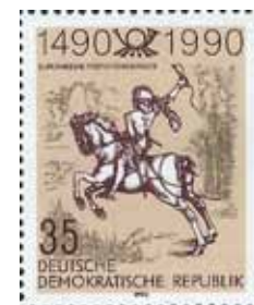
GDR 1990 (Scott 2791)