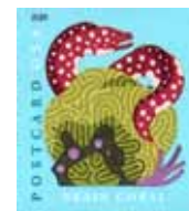
Spotted Moray Eel & Brain coral

[The other United States postage stamps showing corals was a set of 10 37¢ Pacific Coral Reef stamps in a single pane on January 2, 2004 (Scott 3831a-j). Those stamps are not shown here.]