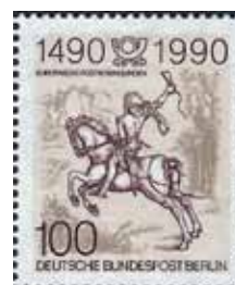
Germany Berlin 1990 (Scott 9N584)