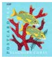
Blue-striped Grunt & Staghorn coral