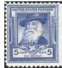
1940 (Scott 867) [Famous Americans Issues]