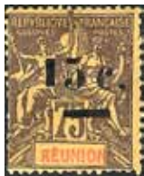
Navigation & Commerce. Reunion 1901 (Scott 58)