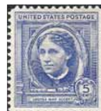
1940 (Scott 862) [Famous Americans Issues]

At the age of 30 Louisa May Alcott (1832–1898) a volunteer nurse from Concord, Massachusetts, spent several weeks tending to wounded soldiers at the Union Military Hospital, a converted hotel, in Georgetown. After only several weeks she became ill with typhoid and was sent home and was expected to die. Typhoid, a highly contagious disease was a dreaded killer during the Civil War and was responsible for thousands of death. But Alcott survived and went on to publish Hospital Sketches in 1863 about her Civil War nursing experiences and later Little Women , her most famous work.