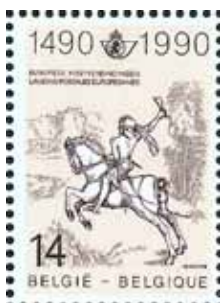
Belgium 1990 (Scott 1332)

The design for the stamp is based on a copper plate engraving by Albrecht Dürer. It’s original title is Der Kleine Postreiter and can be dated from the late 15th century. Reinhold Gerstetter of the Federal Printing Office in Berlin designed the stamp in four versions and shows the rider with a sword and whip riding through a wooded landscape. [Ref: “500 Years of European Mail” by Edgar Lewy. Scott Stamp Monthly 1990; 8(12): 22-23]