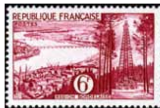
Bordeaux in southwest France on the Garonne River is a commercial seaport upstream from the Girond estuary and in 1918 was an American military base. France 1955