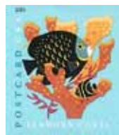
French Angelfish & Elkhorn coral