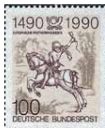
Germany 1990 (Scott 1592)