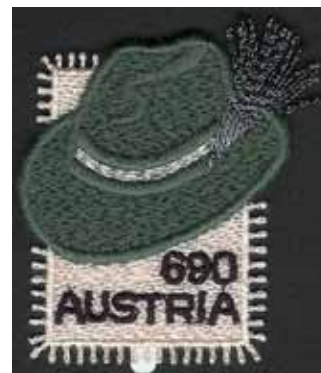
Styrian hat (embroidered stamp). Austria 2018 (Scott 2757) [First Prize for Most Innovative Stamp]