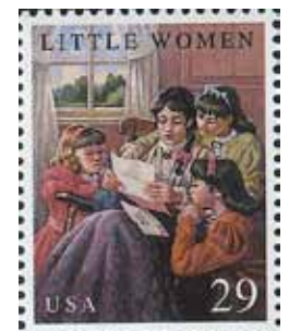
1993 (Scott 2788) [Classic Books]