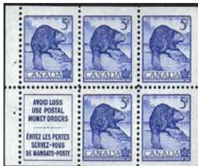
Canada 1954 (Scott 336a)