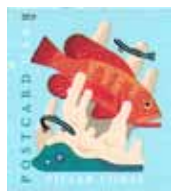
Coney Grouper, Neon Goby & Pillar coral

Four nondenominated (35¢) postcard-rate stmps showing stylized images of stony corals and associated coral reef fish were issued in panes of twenty and coils of one hundred. Both were printed by Ashton Potter with pressure-sensitive adhesive. They were designed by Tyler Lang of Portland, Oregon. The coil stamps are shown here.