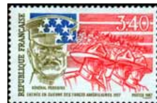
Major General John J. ‘Black Jack’ Pershing, commander of the AEF and ‘doughboys’. The pandemic killed 25,000 men in this force. France 1987