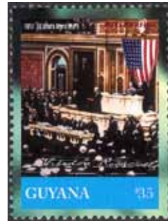
The United States enters World War I, April 2, 1917 Guyana 1999