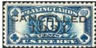
Playing Card Revenue Stamp. 1930 (Scott RF24).