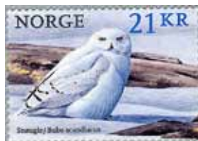
Snowy Owl ( Bubo scandiacus ). Norway 2018 (Scott 1841) [First Prize for the Best Stamp in the World]

The jury for the above awards was formed by Presidents of the Federation of European Philatelic Associations (FEPA) from its 33 constituent countries. FEPA was formed in 1989 to represent and promote European philately, although there are now several non-European countries. The 2019 awards were given on October 19, 2019, at the Spanish Royal Mint in Madrid, Spain, for stamps issued in 2018. There are ten categories of awards with first, second and third place winners in each category. I am illustrating only two of the winners below.