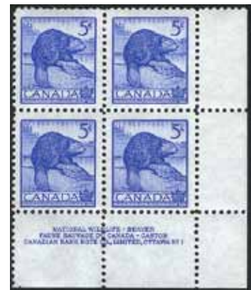
Canada 1954 (Scott 336)

Q5. Who was the first woman to design a United States postage stamp and what stamp did she design?