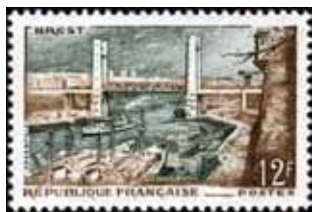
Brest in northwest France on the Atlantic Ocean was an important seaport and debarkation point for American troops and supplies in World War I. France 1957